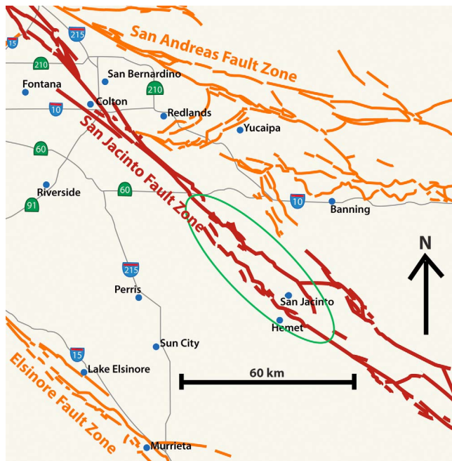
Figure 1. Map of the northern San Jacinto Fault Zone (red) and surrounding faults (orange), southern California. The stepover in the middle of the map, circled in green, includes a small fault segment between the main strands of the fault; this geometry was the basis for the current study. The San Geronio Pass area of the San Andreas Fault, in the upper right of this map, is also characterized by extremely complex and discontinuous geometry. Fault geometry based on the USGS Quaternary Fault Database.

unclamping, thereby reducing the distance that rupture can jump. We initially nucleate rupture by raising the shear stress above the yield stress over a designated patch; rupture re-nucleation after a jump occurs naturally based on the model stresses. Other physical and computational parameters are listed in Table 2. Further details of our model setup are presented in the auxiliary material. 1